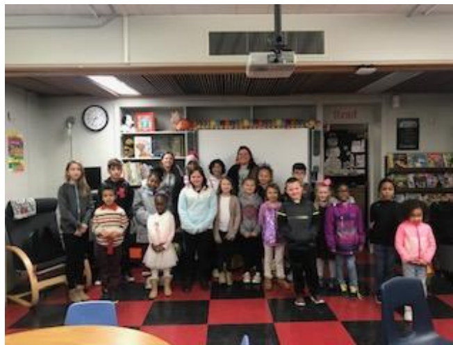
January Student of the Month / Principal Breakfast